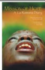
Mission of Hope: A La Romana Diary