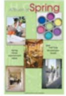
Home Improvements 2010