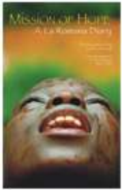
Mission of Hope: A La Romana Diary