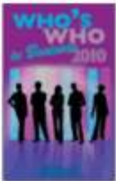
Who's Who in Business 2010