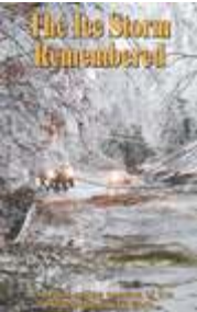
The Ice Storm Remembered