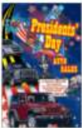
Presidents' Day Auto Sales