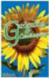
Gardening & Landscaping