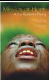
Mission of Hope: A La Romana Diary