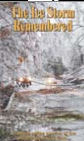
The Ice Storm Remembered

job working with youths in detention in Florida; he lost that job when a hurricane destroyed the detention center where he worked.