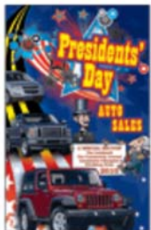
Presidents' Day Auto Sales