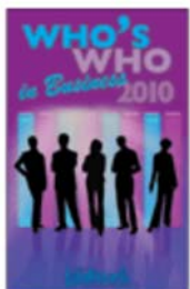
Who's Who in Business 2010