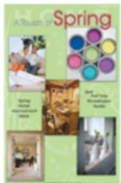
Home Improvements 2010