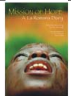
Mission of Hope: A La Romana Diary