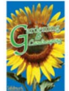
Gardening & Landscaping