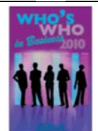
Who's Who in Business 2010