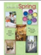
Home Improvements 2010