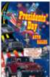
Presidents' Day Auto Sales