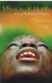
Mission of Hope: A La Romana Diary