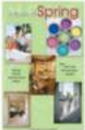
Home Improvements 2010