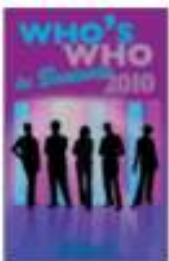
Who's Who in Business 2010