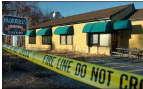
Arson is suspected in a fire Saturday night at the former Shamrock's Pub & Eatery, 700 Main St.

Nearly three dozen Holden firefighters were assisted by