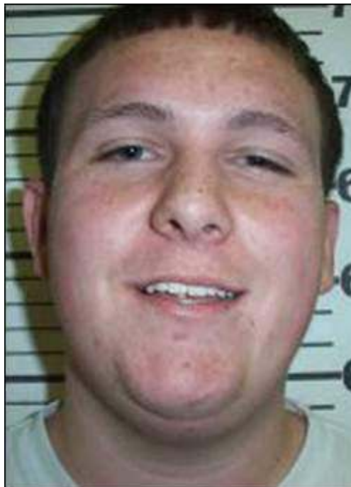
Simpson Enlarge photo

A third teenager, a 16-year-old Worcester boy who